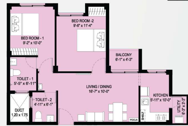
SA 815 sq.ft CA 552 sq.ft