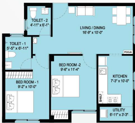
SA 780 sq.ft CA 562 sq.ft