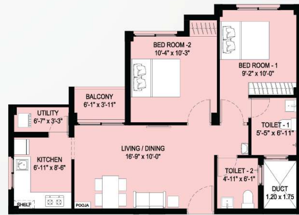
SA 810 sq.ft CA 562 sq.ft